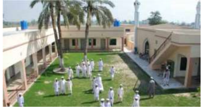
Khubaib Madrissa, Hamza Wala, Muzaffargarh