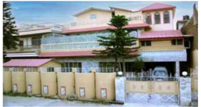
Muhammadan School of Advance Learning (MSAL), Rawalpindi