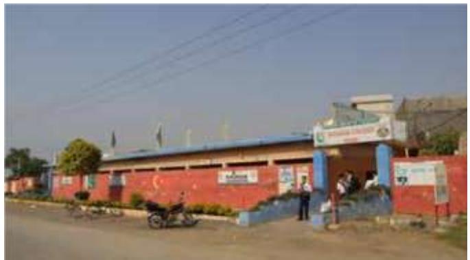
Khubaib College RUMI, Haripur