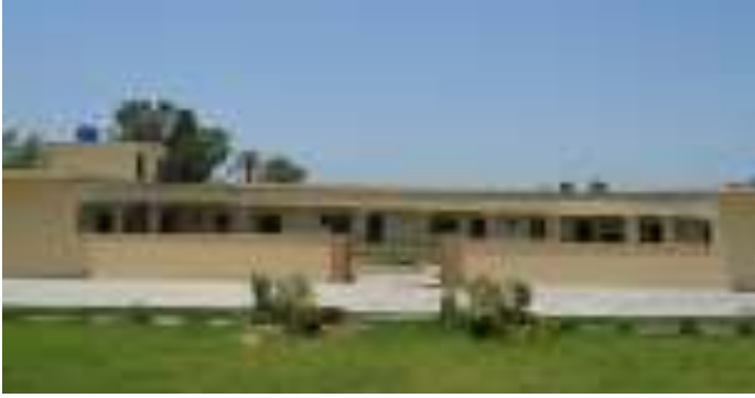
Khubaib School Bukhewala, Muzaffargarh