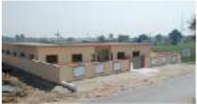
Khubaib College, Muzaffargarh